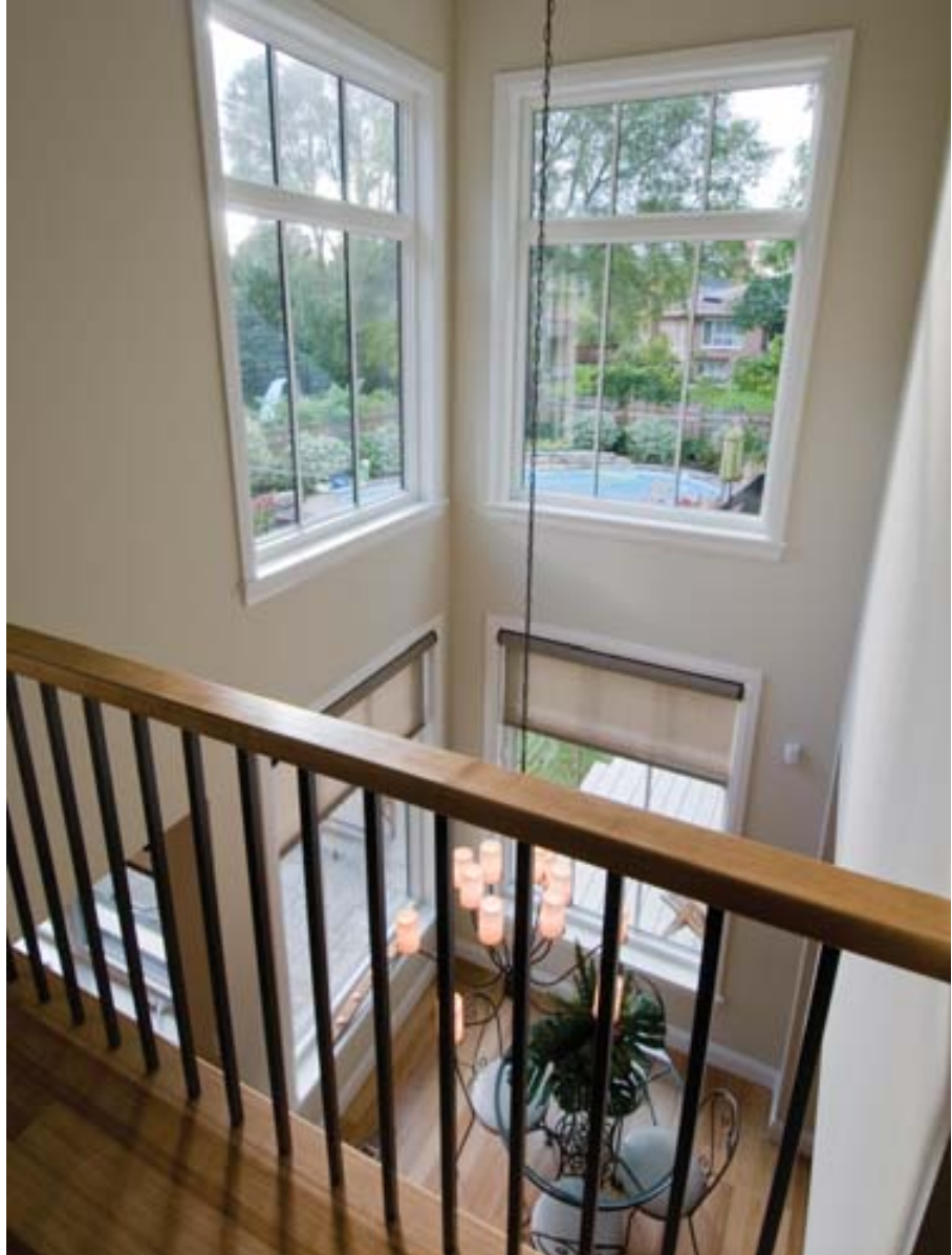
Discuss the specifics of the project well in advance to help avoid conflicts during stressful phases of the renovation.

Also recommended, it's easier to buy things all at once, so that they'll match and there won't be a problem with supply of any of the parts. For instance, plumbing accessories such as faucet sets are sold in two parts. The rough-ins are the pieces that are installed inside the wall, but they are sold separately from the external parts such as the taps and faucets. In order to make sure you have a complete, functioning package, buy all the parts together, even if the contractor only needs the rough-ins to start.